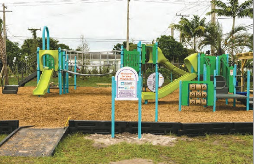
The new playground will give children more opportunities to participate in physical activity.