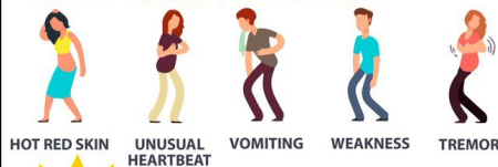
HOT RED SKIN UNUSUAL HEARTBEAT VOMITING WEAKNESS TREMOR

If someone has a throbbing headache, vomiting, a rapid strong pulse, not sweating, or are unconscious, CALL 911 RIGHT AWAY and help cool the person until help arrives.