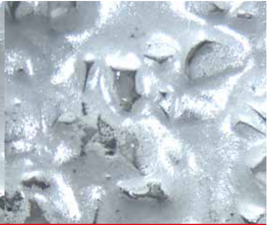
Traditional Aggregate Controlled abrasion test: notice "Pop Out" of aggregate Auto-Gard T Controlled abrasion test: aggregate bonds to coating.