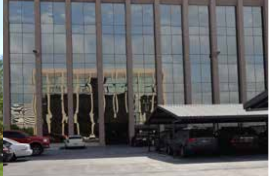
Husman House Cincinnati, OH Auto-Gard FC T Yorktown Plaza Houston, Texas Auto-Gard T