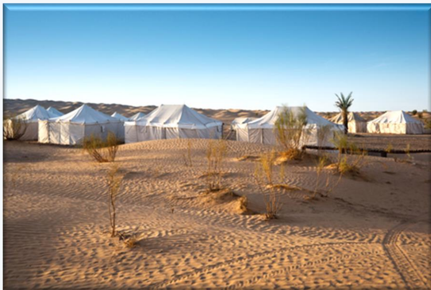
Photo is an example of one of the desert camps in the area.

the small town of Merzouga to prepare for our desert experience. You have the option to choose between a 1.5-hour camel trek or a 30-minute jeep safari across the mesmerizing Erg Chebbi sand dunes, leading us to our peaceful Sahara Desert Camp. Here we'll settle into well-appointed desert tents, watch the breathtaking sunset, and spend the evening enjoying traditional music around the campfire, savoring delicious food, and stargazing under the clear desert sky. Overnight at 4* desert camp. (B,L,D)