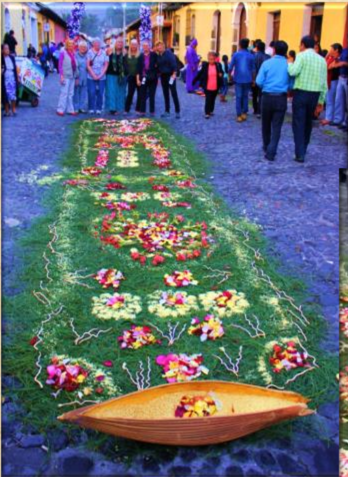
Left photo: Loom Dancer's carpet in 2016

After sunset, we have an amazing treat in store. In Antigua, corresponding to the 40 days of Lent, each Sunday there is a procession in the streets. We have timed our itinerary to coincide with the phenomenon of the Procession of Santa Inés. It seems that the entire city turns out to build carpets of flowers to line the route of the procession. We will build a carpet of our own and watch the colorful spectacle unfold before us. It is quite a cultural treat! Overnight at Palacio de Doña Leonor. (B)