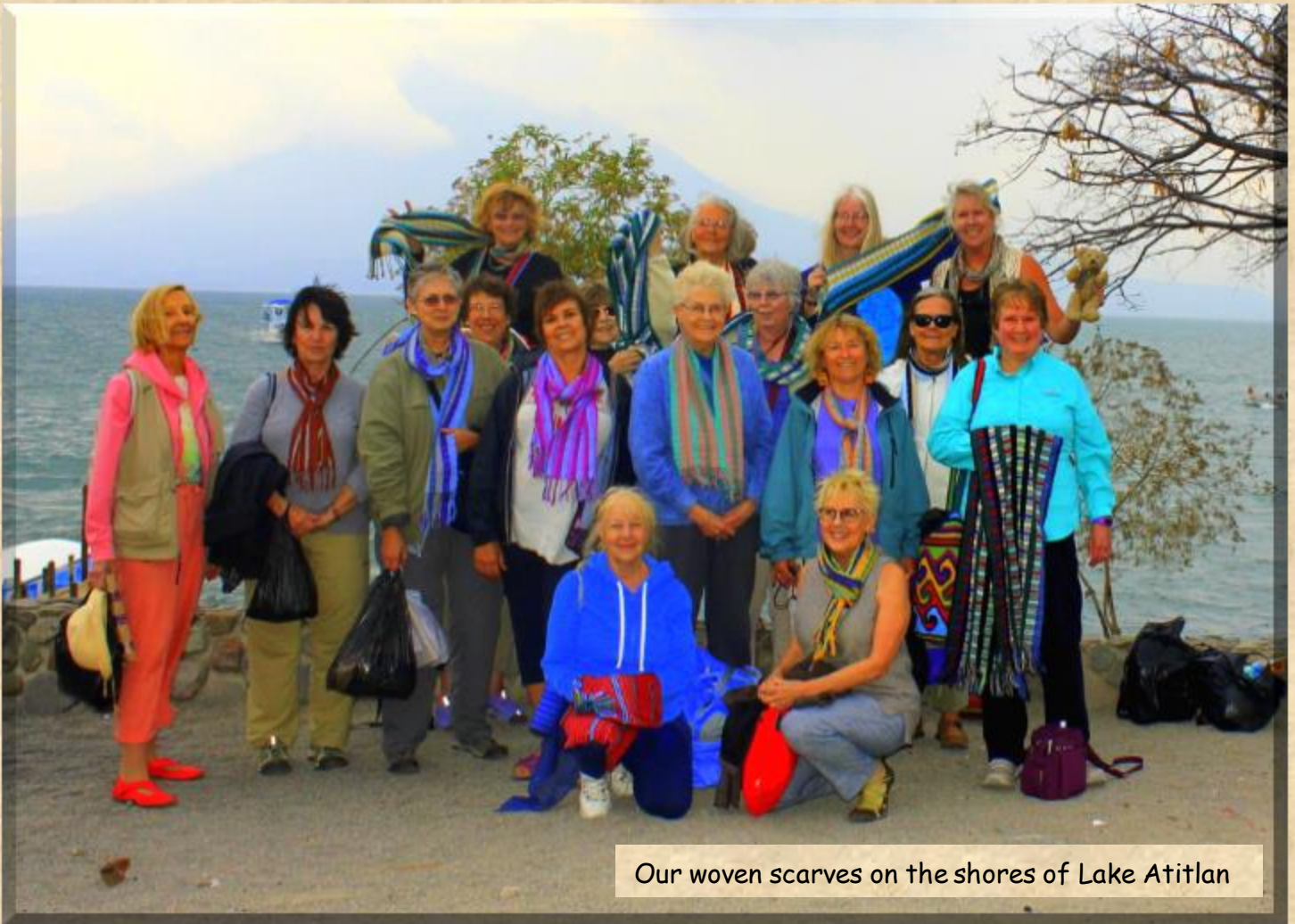
Our woven scarves on the shores of Lake Atitlan

This morning we begin our drive back to Antigua (approximately three hours) with a stop en route a wonderful cooperative where they make felted animals. After lunch at a local restaurant (not included), we continue on to Antigua and Palacio de Doña Leonor, arriving in the early evening. Overnight in Antigua at Palacio de Doña Leonor. (B)