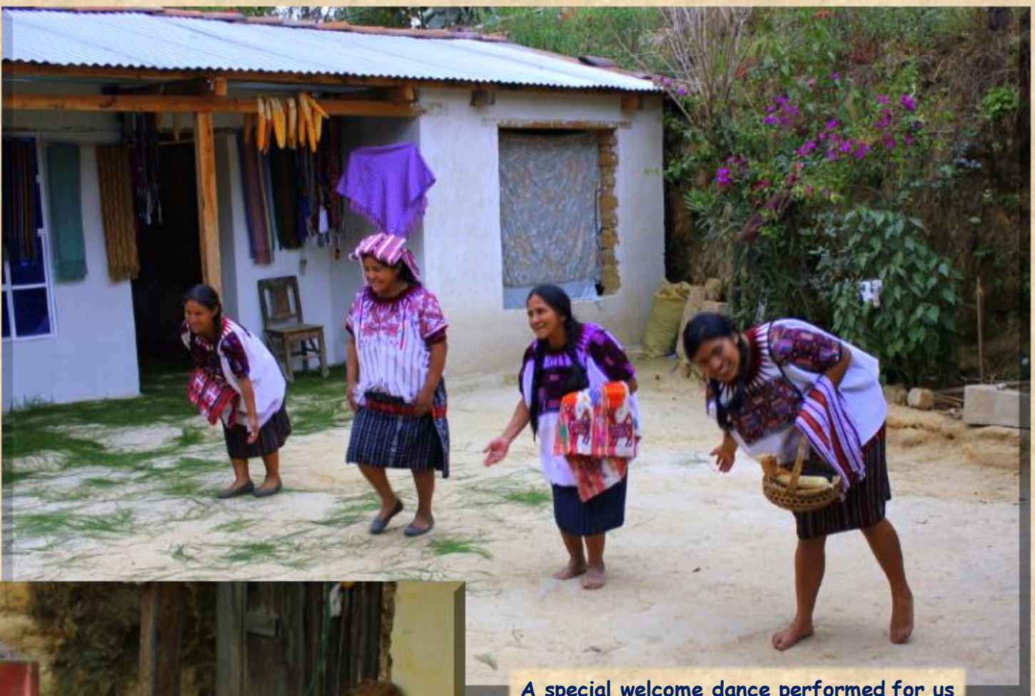
A special welcome dance performed for us