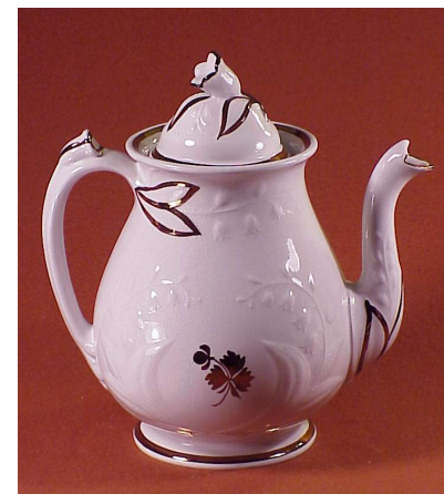
Anthony Shaw Lily-of-the-Valley Tea Leaf Coffeepot, circa 1860s

For collectors and enthusiasts of Tea Leaf Ironstone China and its Copper Lustre cousins, including Ceres, Moss Rose, and more!