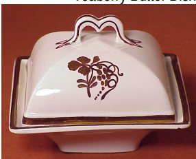
Clementson Heavy Square Teaberry Butter Dish