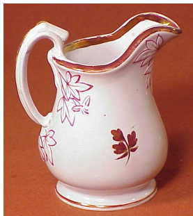
Davenport Fig Cousin Tea Leaf Creamer