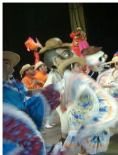
Carnaval en Mazatlan at Harris Theater

http://www.bing.com/videos/search?q=Pepe+Aguilar+2008&&view=detail&mid=50D5C1236E32E3363FC950D5C1236E32E3363FC9&rvs=mid=50D5C1236E32E3363FC950D5C1236E32E3363FC9&fsscr=0&FORM=VDFSRV Slide to 2:15 minute mark.