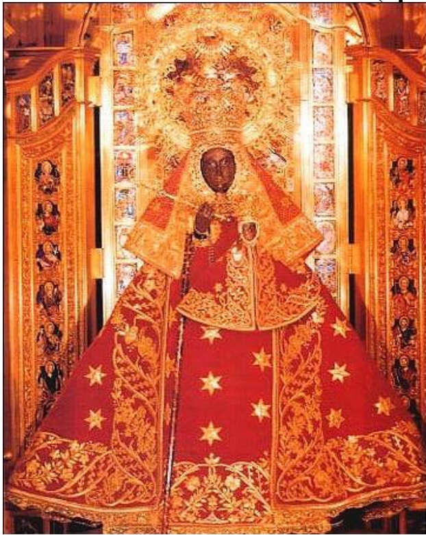
The true Santa Maria de Guadalupe in the town of Guadalupe in Province of Caceres in Extremadura, Spain

The Spanish Guadalupe is a wood carving said to have been created by St. Luke. Other accounts place its origin at about the 6th century. I could not find supporting information either way and I have not found what her name was at that time. It is dressed in rich brocade cloaks. Other than her dark skin it is not at all like the Tepeyac image in Mexico City. The Mary of Cáceres statue (as stated I could not find what she was named at that time), carries the Child Jesus in her left arm, holds a royal crystal scepter in her right and wears a gold crown on her head.