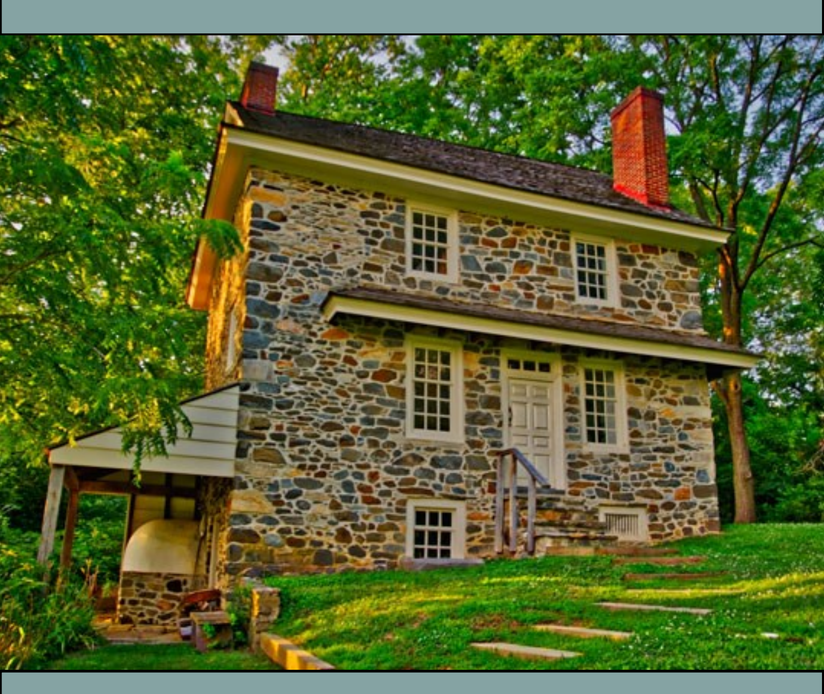
2024 Event Sponsorship Opportunities