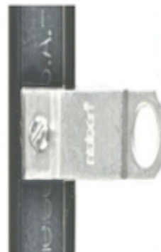
Screw in Hanger for Metal Frame

Supplies: Screw in hanger, screws, wire from frame or hardware store. (The wire may be plastic coated.)