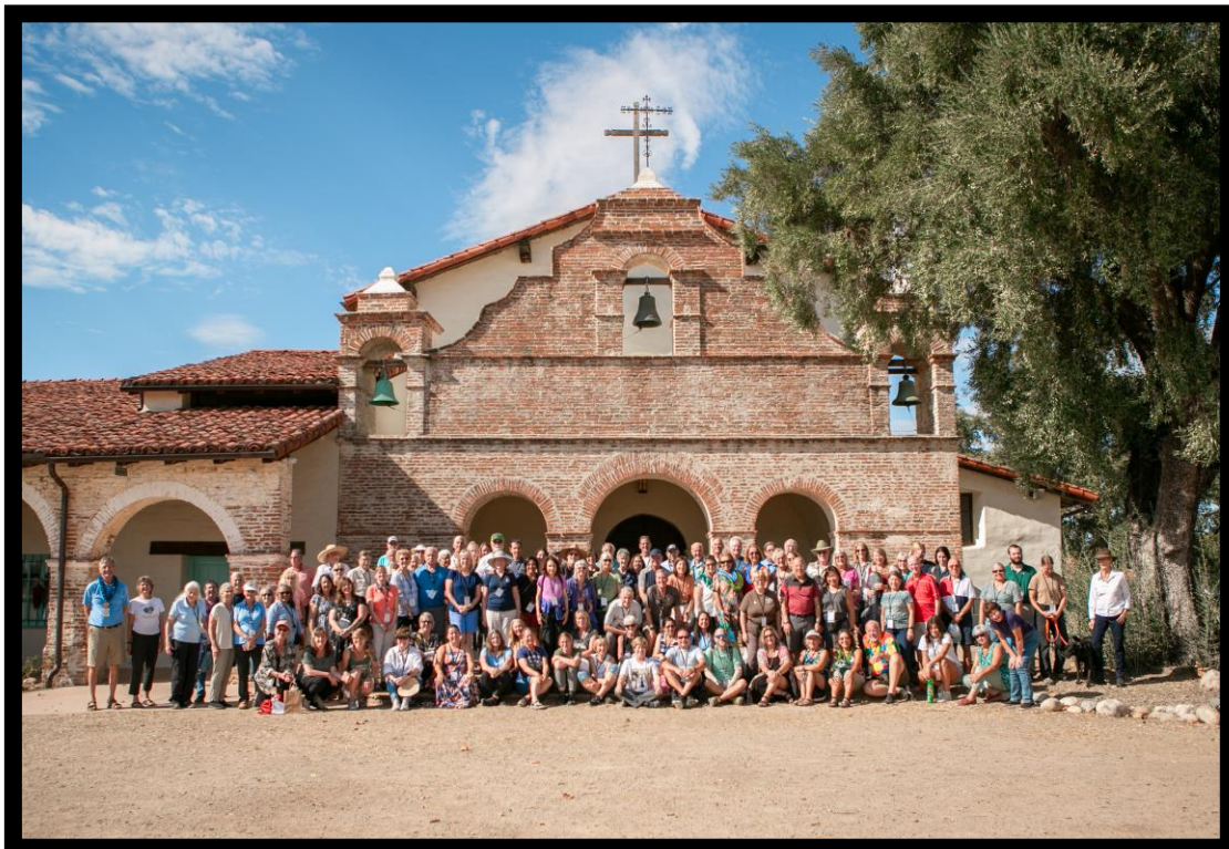
Mission Walkers Conference October 2024