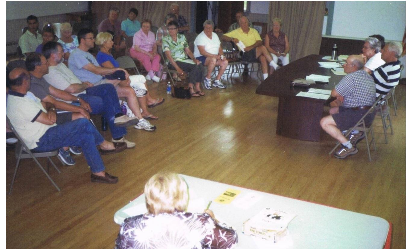
The 2012 Torsey Pond Association meeting was the first held at the Readfield Town Office. The 2013 meeting will also be at the Town Office at 10 a.m. Saturday, July 13.