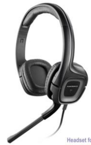
Headset for DRUID D-06