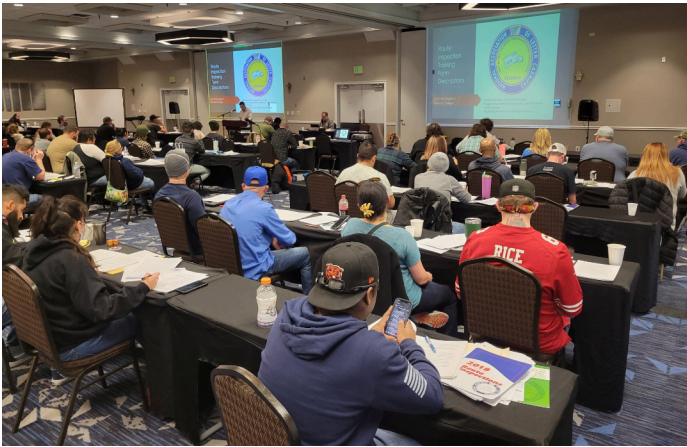
2022 COSALC Steward's College