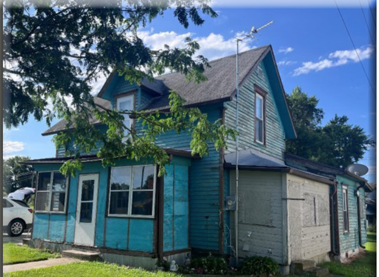
Before and After photos from a previous lead reduction project in Villisca.