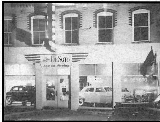
The Fox Motors Dealership, ca. 1948