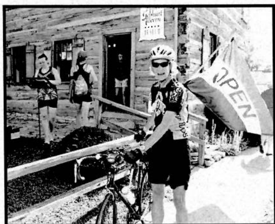
Bikers stop at the Tavern

The Miami Conservancy District, City of Miamisburg and City of Franklin sponsored the "Drive Less, Live More River Ride" on Sat. morning, July 24. Bicyclists rode the bike path from Franklin to Miamisburg stopping at five locations in downtown Miamisburg. Their final stop was our Heritage Village