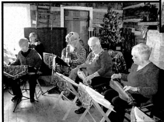
Star City Dulcimers