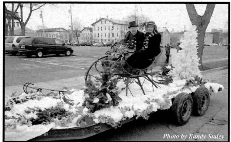
Black and white photos do not convey the beauty of the float.