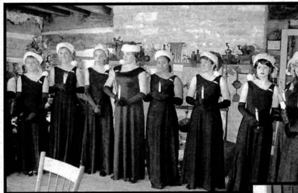
Miamisburg High School Madrigal Singers