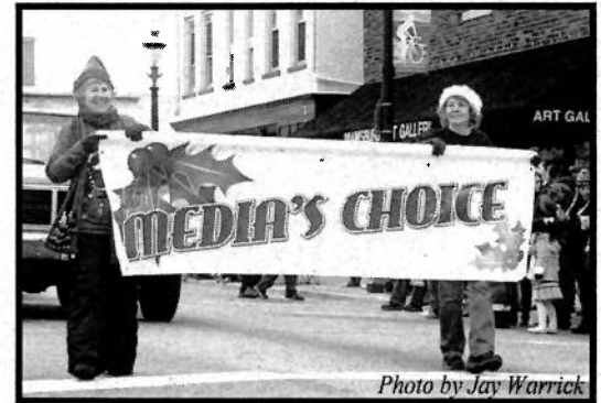
Carolyn Kilpatrick and Judy Wuerstl carry the Media's Choice Award banner.