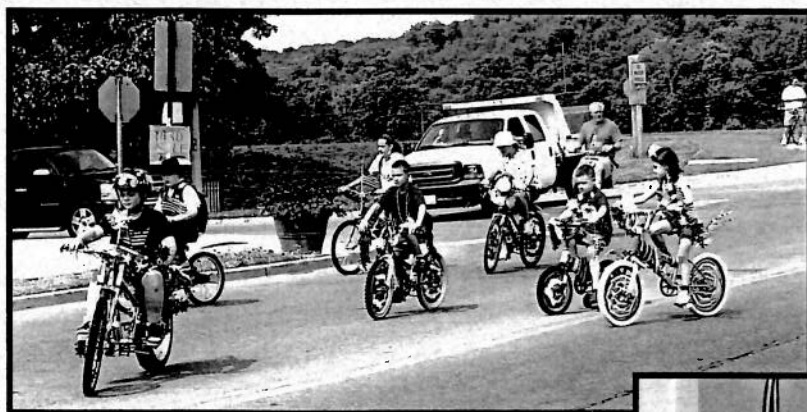
Children with decorated bikes take part in the Memorial Day Parade.