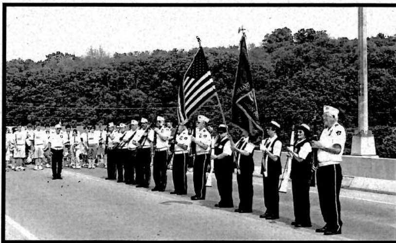
Memorial Day Service on Linden Avenue Bridge