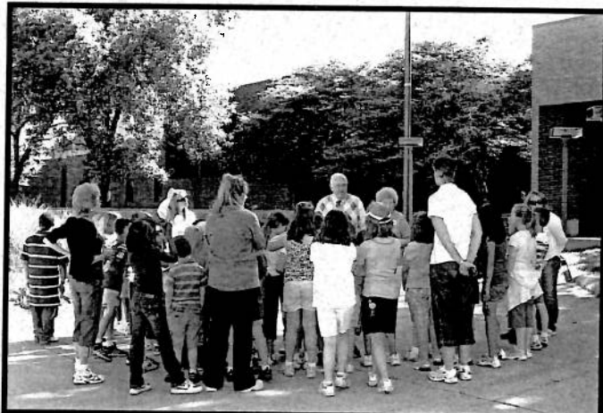
Students stop at the Civic Center for a visit with Mayor Church.