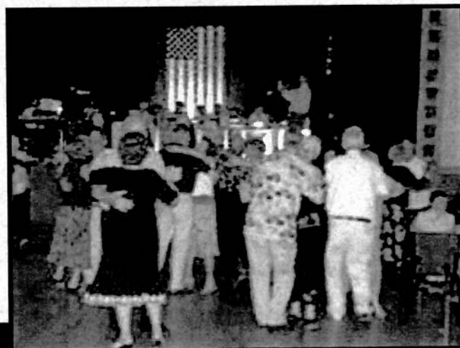
Dancers enjoy the big band music at the Victory Dance at the Baum.