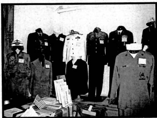
Military Display at the Market Square Building