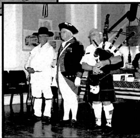
Re-enactors perform at the Silver Taps Program.