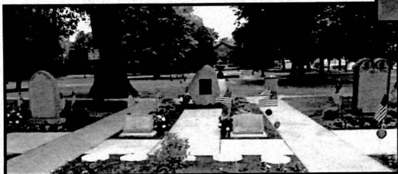
Memorial stones in newly paved and landscaped area at Library Park.