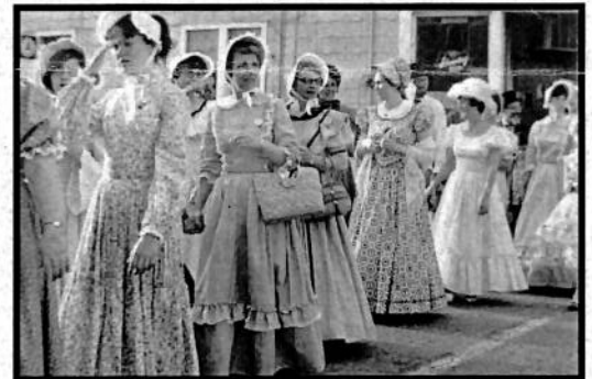
Scenes from the 1968 Sesquicentennial

Were you around when the city celebrated its Sesquicentennial in 1968? It was a huge event for Miamisburg. The men grew mustaches and beards and were even "arrested" if they were seen in public, clean shaven. The women sewed 1800's dresses and matching outfits for the children. There were style shows, antique shows, a professionally directed pageant at Harmon Field, a cow milking contest, several parades, and numerous other fun events which kept everyone very busy for over a week.