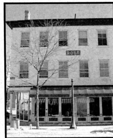
The Rost Building S.E. Corner of Central & Main