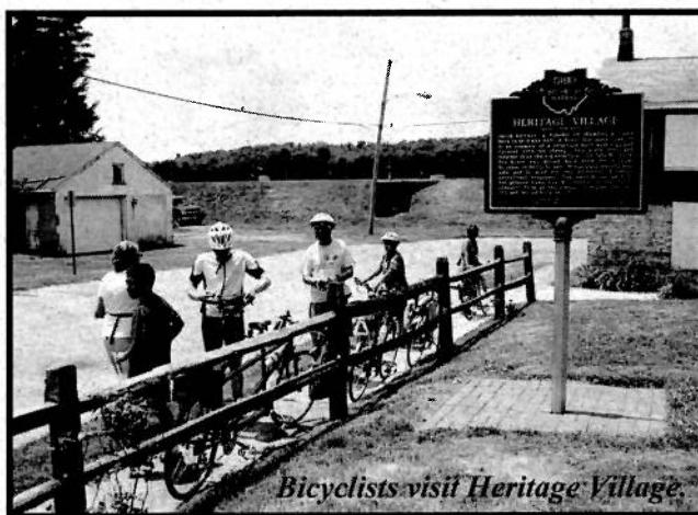
Bicyclists visit Heritage Village.