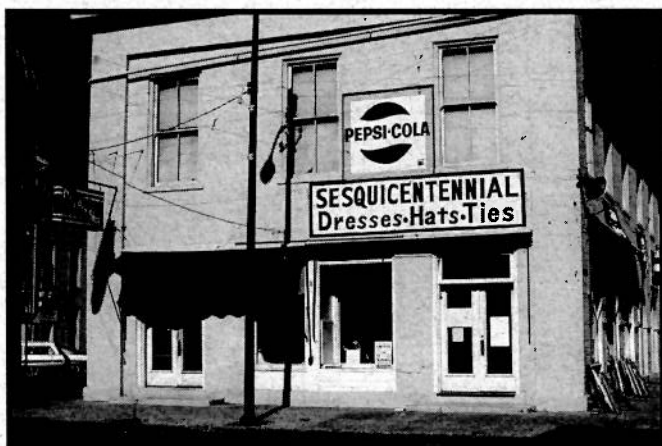
Market Square served as Sesquicentennial Headquarters. Small Mary Ann Shop sign may be seen on left hand side.

Just to whet your appetite for our 2018 celebration, below are a few photos from our Sesquicentennial celebration in 1968. It was a fun-filled week, and an amazing display of community spirit where young and old alike took part. We can do it again in 2018, but we need YOUR help to make it happen!