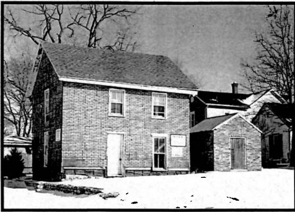
Kercher Cabin and adjoining smokehouse