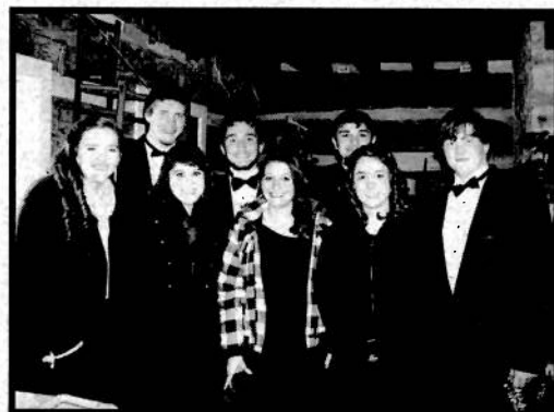
Miamisburg High School Madrigal Singers

If you've never been to "Christmas at the Tavern", you're missing out on one of the nicest events provided by the Society. Make a point to stop by next year and we guarantee you'll make it an annual event.