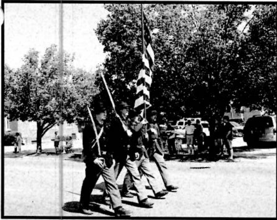
Ohio 93rd Volunteer Infantry Honor Guard Re-enactors