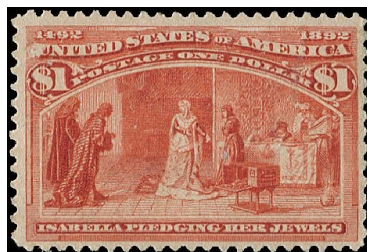
Examples Scott 241 and 78a