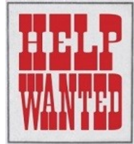
EXHIBIT CHAIRPERSON NEEDED