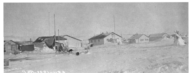
RCMP Post, Herschel Island 1929

Left Edmonton 11/25/29 4PM, train to Fort Mc Murray, left Fort McMurray via air starting 12/10/29, arrived Aklavik 12/27/29, reached Herschel Island via dog sled 01/02/30, arrived back at Aklavik 08/03/30, back to Edmonton 08/15/30