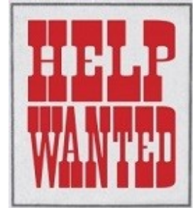
EXHIBIT CHAIRPERSON NEEDED