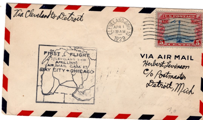
Cachet updated on 4/1-2/1929 adding Toledo and Cleveland. Also shows Detroit to Flint. Note that flight did not go over Lake Erie at this time.