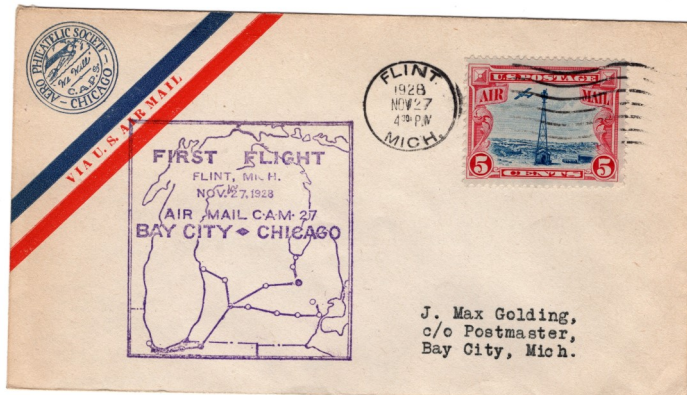
Cachet updated 11/27/1928 adding Flint and Pontiac