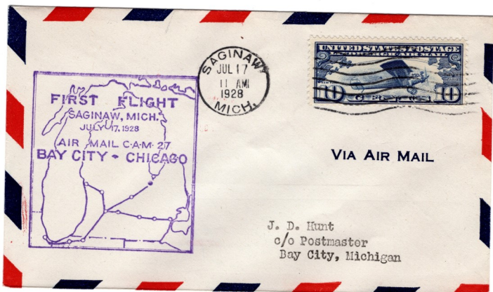
Cachet showing the map with the 13 original cities.

Contract Air mail Route 27, as originally placed in operation, was unique in that it serviced a greater number of cities than any previous Contract Air mail route. The inaugural service covered the vast automobile district of Michigan. It had three distinct northern terminals: from Chicago to Kalamazoo, where it split into three segments to Muskegon, Detroit and Bay City. Many changes were made after its inception in an endeavor to simplify and improve service. The cachet illustrates the map of the original routes of CAM 27. A dot was filled that corresponds to the postmark of the city on the first flight cover. As cities were added the route map was modified. For CAM 27, a set of first flight covers would include both east and west bound flights with a couple of exceptions. The exceptions would be the cities of Muskegon, Detroit and Bay City for only one direction. The other exception would be Kalamazoo which had four directions for covers.