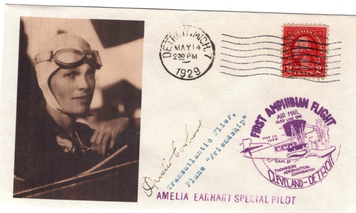
On 5/14-15/1929 the first amphibian flight over Lake Erie took place. The Detroit to Cleveland segment was flown by Amelia Earhart.

Other cities were added to CAM 27 as follows: 3/5/1930 Mishawaka, 12/8/1930 Fort Wayne, 2/10/1933 Columbus and 2/11/1933 London Ontario and Buffalo.