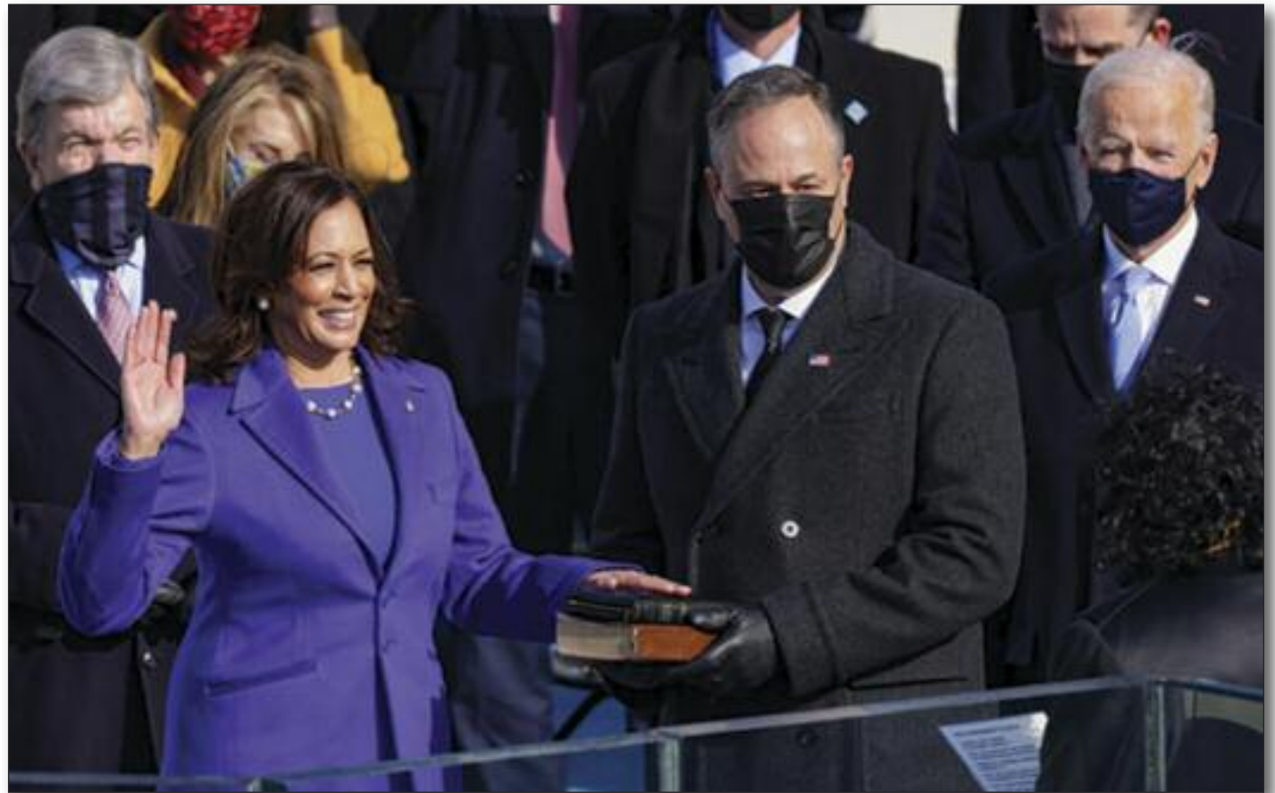
Vice President Kamala Harris shown with Husband, Douglas Craig Emhoff, as she is sworn in as the 46th Vice-President of the United States of America.

"The advisory board will help shape my approach to managing the surge in reported infections; ensuring vaccines are safe, effective, and distributed efficiently, equitably, and free; and protecting at-risk populations," Biden said in a statement.