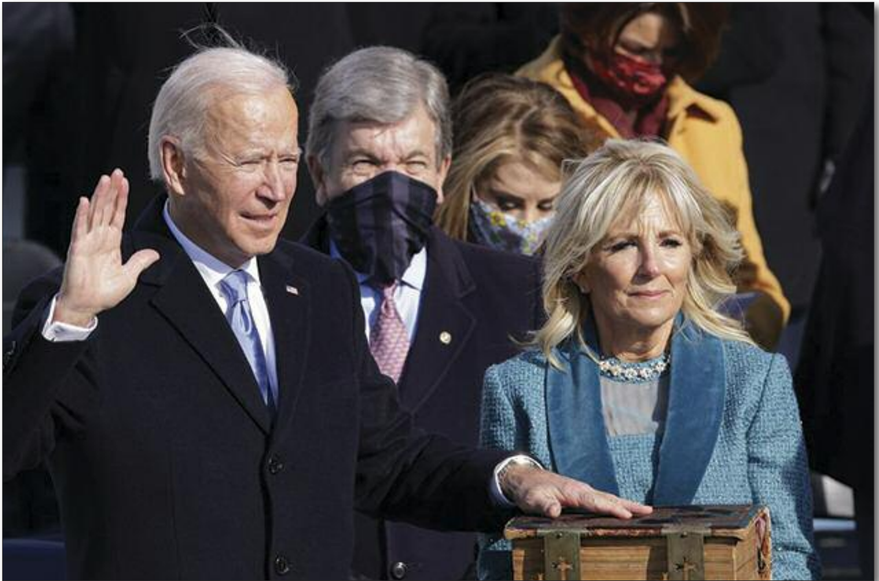
President Joseph Biden shown with wife, Jill Biden, as he is sworn in as the 46th President of the United States of America.

Joseph Biden and Kamala Harris was sworn in January 20, 2021 as President and Vice President of the United States of America. This is historic for a number of reasons.