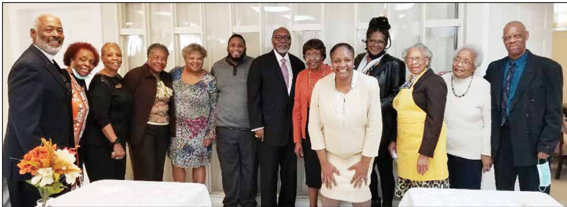
Above: Members of the Trinity AME Church Leadership gather for an event. Below: Men of Trinity gather for a special program.