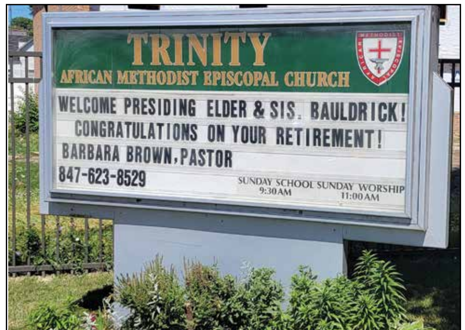
The Trinity Billboard is a Welcome Sign to the Southside Community.