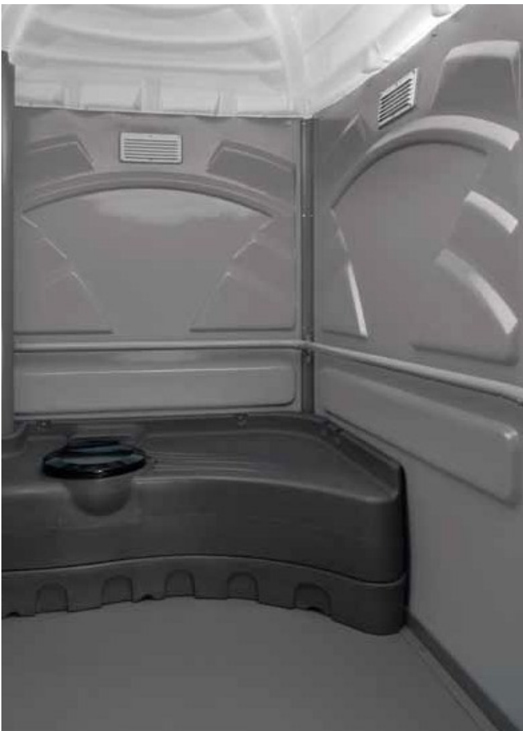
Roomy interior provides 360 degree turning radius, extended bench for transferring from wheelchair and wrap around handrails.