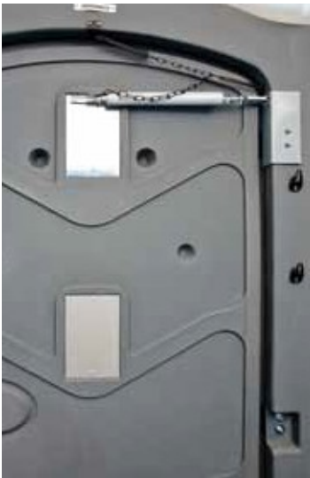
Dual coat hooks and mirrors. Pneumatic door closer with safety chain