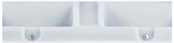
Vent screens for improved ventilation