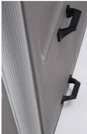
Heavy duty grab handles for safe loading and maneuverability